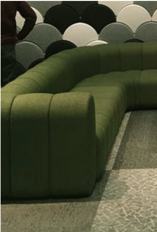
BLÅ STATION SDW17

It is lush in matte suede, and vital in a polished finish, and acts as a catalyst to other colors in prints.