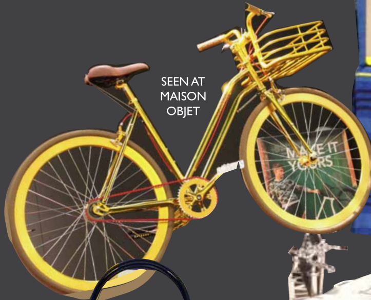
SEEN AT MAISON OBJET